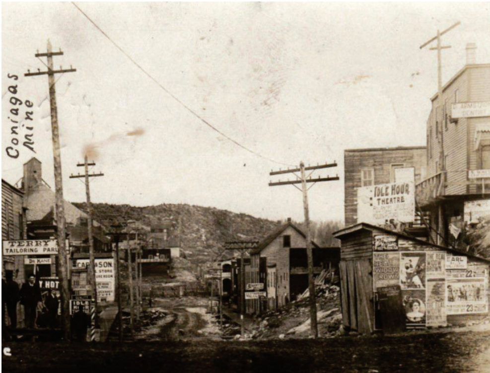
Looking north along Argente St. The Imperial Bank is off camera, right. The slope-roofed shed, front right, housed the hose reels. The walls are papered with handbills.