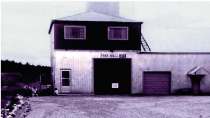
North Cobalt Firehall

The Prospect Avenue location is poorly documented in terms of images - we have no photos of firemen, gear, or vehicles. If it weren't for the fact that the 1948 insurance maps clearly show "Fire Station" at this address, we wouldn't have a clue where the station was located. Maybe our members have more information to share?