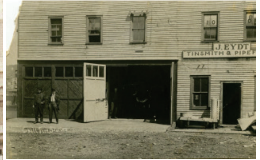
The first fire station, above, circa 1910, was on Silver Street, in the premises of a former Hardware Store, north of the intersection of Prospect Avenue, roughly the same location as today's fire hall.