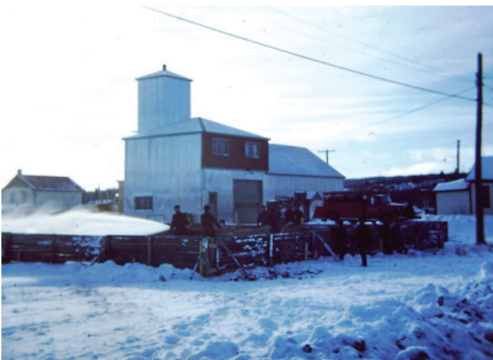
Another View of the North Cobalt Fire Hall