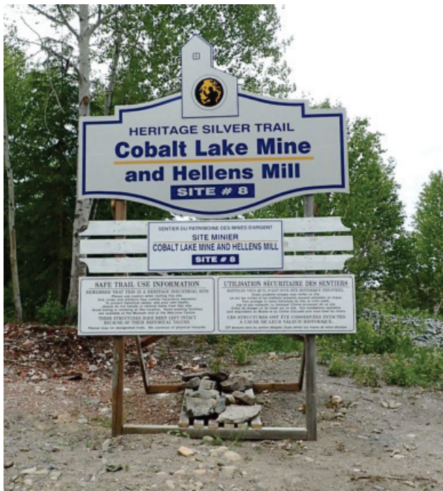
Below, the former Hellens Mill site at the south end of Cobalt Lake is a new addition to the trail.

The Cobalt Lake Mine and Hellens Mill site has officially been added to the trail. Agnico suggested that we create a viewing platform and to further enhance the site for visitors. We think it's a great idea!