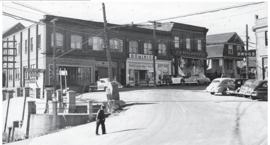
The Herbert Block from 1950. The fire station is behind the utility pole left of centre, between Hebert Fuels and the Dominion. Photographer Syd Watkinson is standing beside the Imperial Bank property on Lang Street.