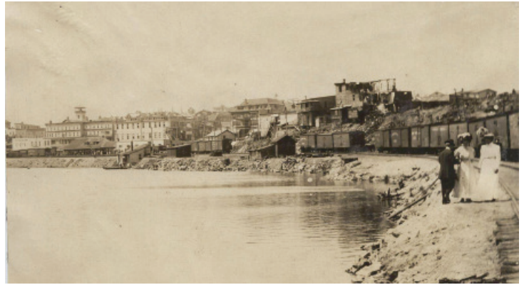
After the 1909 fire. Train station on the left. The pumphouse sits on the shore of Cobalt Lake.