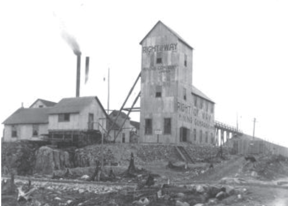
1910- Right of Way mine.

Records show that in 1952 Hellens Mining & Reduction Ltd. re-conditioned the #2 headframe which was then acquired by Cobalt Consolidated Mining Company Ltd. in 1953. Between 1953 and