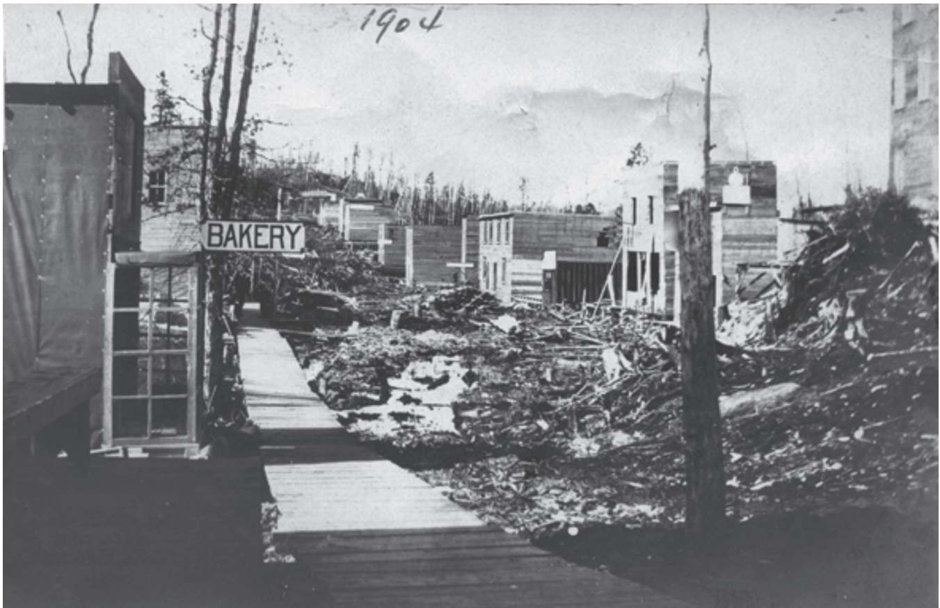
Cobalt- just beginning in 1904